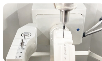
90° Vertical Milling